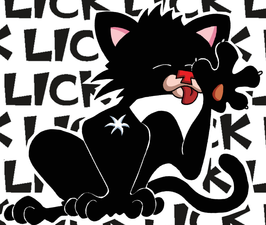
Sometimes, Kitty will do this for hours.

LICK LICK LICK LICK LICK LICK L LICK LICK LICK LICK LICK LI LICK LICK LICK LICK LICK L LICK LICK LICK LICK LICK LI LICK LICK LICK LICK LIC LICK LICK LICK LICK LICK LICK LICK LICK LICK LICK LICK LICK LICK LICK LICK LICK LICK LICK LICK LICK LICK LICK LICK LICK L