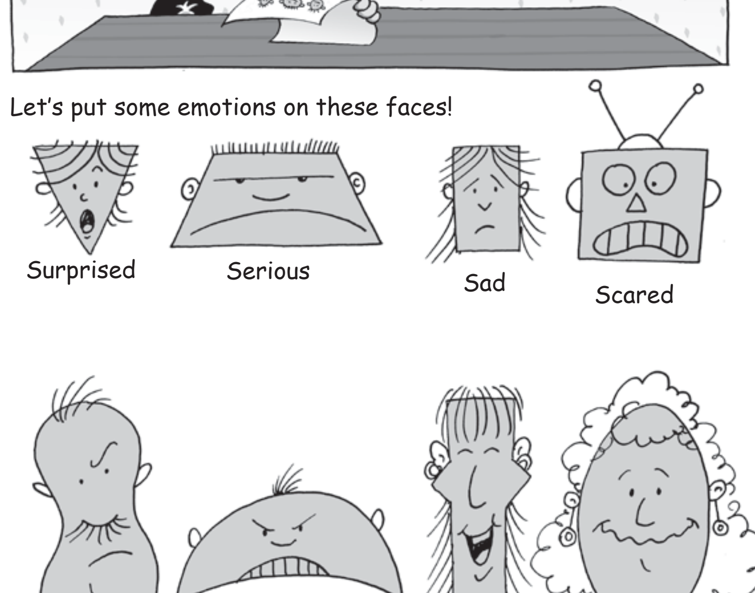
Angry In Love Puzzled Overjoyed